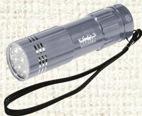
FLASHLIGHT LOGO ITEM