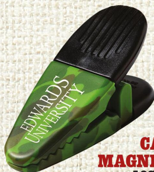
CAMO MAGNETIC CLIP LOGO ITEM

Design Includes: Full Color Imprint Area 7/8"W x 1 1/2"H