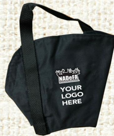
DEER MASK LOGO ITEM