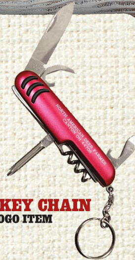
TOOL KEY CHAIN LOGO ITEM