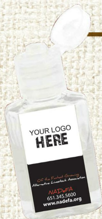
HAND SANITIZER LOGO ITEM

Design Includes: Full Color Imprint Area 7/8"W x 1 1/2"H