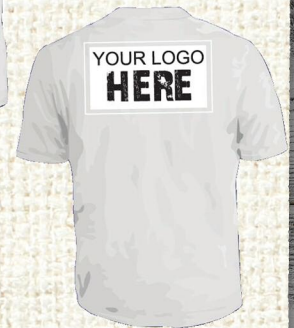
T-SHIRT LOGO ITEM