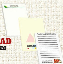
NOTE PAD LOGO ITEM