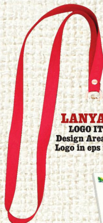
LANYARD LOGO ITEM Design Area: Send Logo in eps format