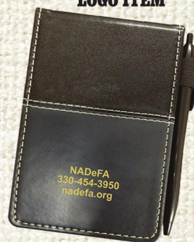
SMALL NOTEBOOK LOGO ITEM