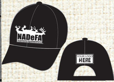
HAT LOGO ITEM Design Area: Send Logo in eps format