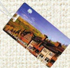
FULL COLOR LUGGAGE TAG LOGO ITEM