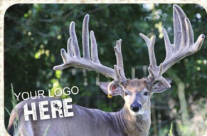
Room Key LOGO ITEM