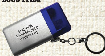
TOOL KEY CHAIN LOGO ITEM