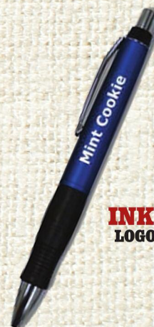
INK PEN LOGO ITEM