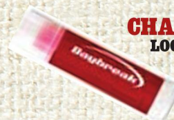
CHAPSTICK LOGO ITEM