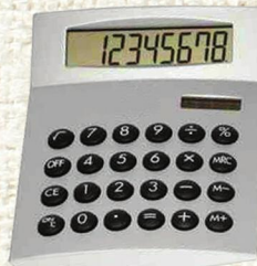
CALCULATOR LOGO ITEM

Imprint Area 3 1/16"W x 4 9/16"H Colors: - Backside - or Eco Green rontside -r front cover to e any way you like. Digital Color.