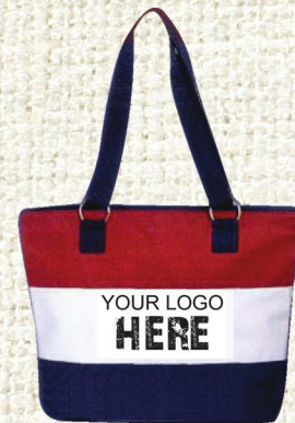
TOTE BAG LOGO ITEM

Imprint Area 3 1/16"W x 4 9/16"H Colors: - Backside - or Eco Green rontside -r front cover to e any way you like. Digital Color.